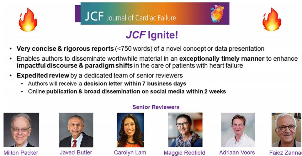
Figure. Overview of the JCF Ignite! Program.